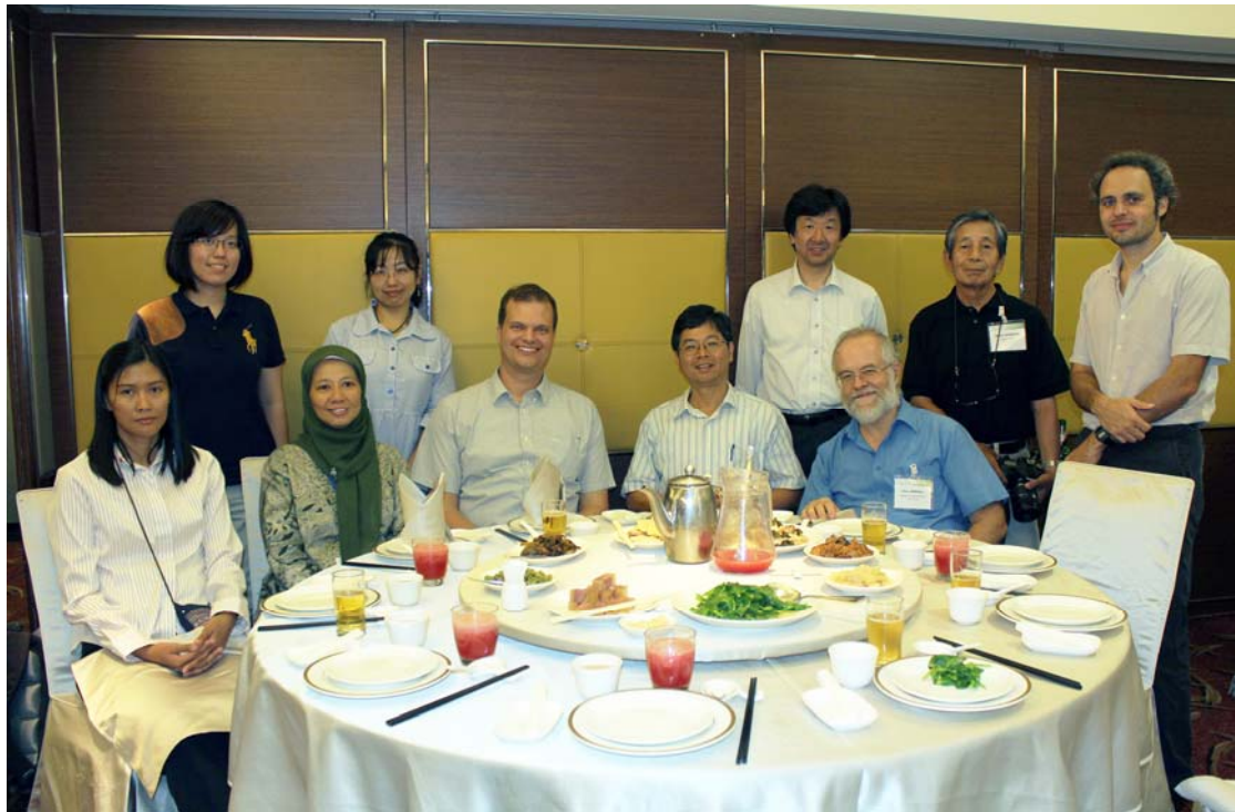
Group dinner at a Chinese restaurant after the session, 8 th August 2011.